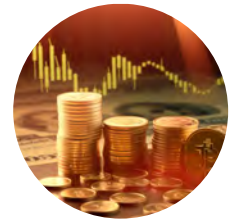
Economic and Social Governance