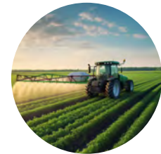
Agribusiness and Food Sovereignty