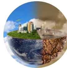
Climate Change and Energy for Productive Use

The plan is anchored on four Key Impact Pillars: